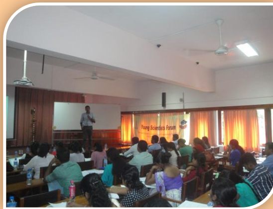
Some participants of the workshop