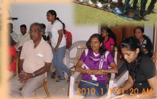
Some events at OBT