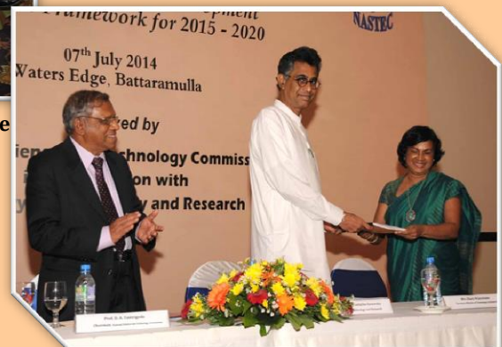
The Secretary, Ministry of Technology and Research, presenting the report to the Hon. Minister of Technology and Research