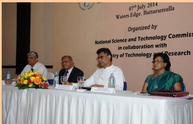
The Minister of Technology and Research and the key officials gracing the head table of the conference