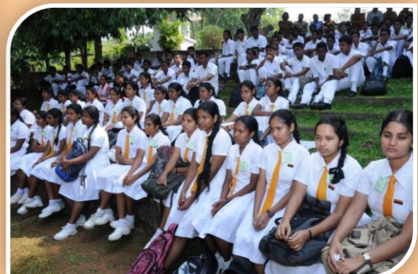
Some of the students who attended the program