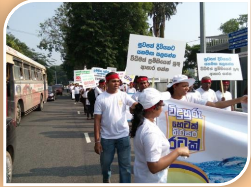
NASTEC Staff attending at the Science Walk