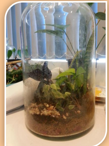
A model Bottle Garden