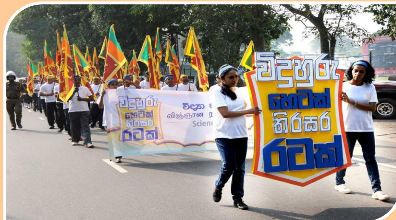
Part of participants walking in the procession displaying the theme of the Science Week

NASTEC participated in the first ever “Science Walk” organized by the Ministry of Technology and Research which was held at a grand scale on 08 th November 2014 with the participation of the Minister of Technology and Research, Hon. Patali Champika Ranawaka, and scientists, officials of the ministry and affiliated institutions, officers of three forces, schools and University students. This walk consisted vehicles exhibiting various technologies including local technology and a water rockets show. The Science Walk marked the last event of the science week.