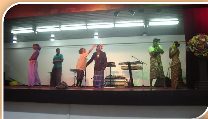
NASTEC Staff performing “Jasaya saha Lenchina Kolama”