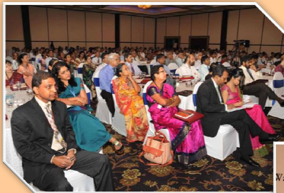
Part of the participants who attended the conference

This report was presented to the Hon. Minister of Technology and Research, Eng. Patali Champika Ranawaka.