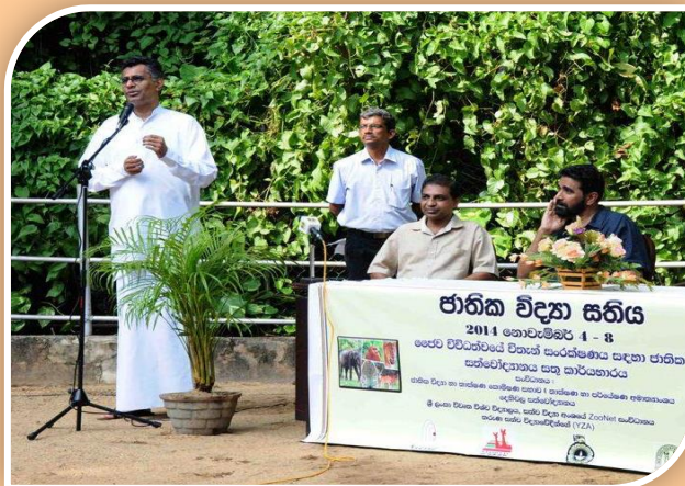
Hon. Minister of Technology and Research delivering his speech at the event